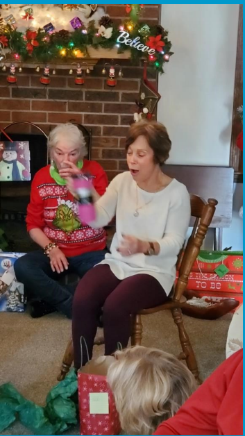
Southern Wings Christmas Party!