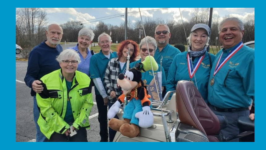
New Years Day Ride Jack's in Hoschton