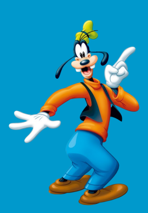
"I Love to Ride & Travel"