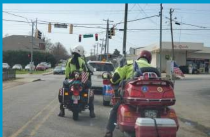
Pi Day Ride Yesterday's Café Rutledge