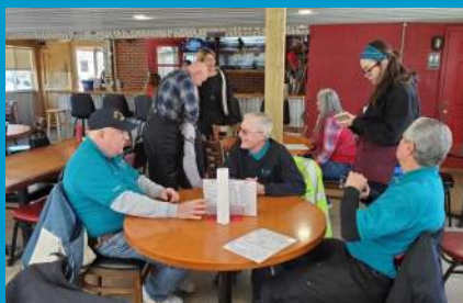
Rooster's Café Mansfield