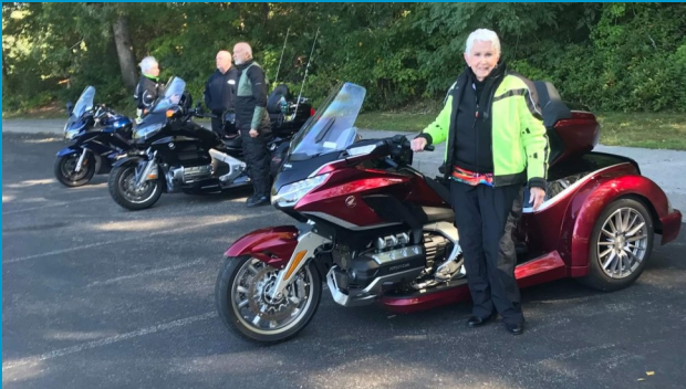
Tail of the Dragon