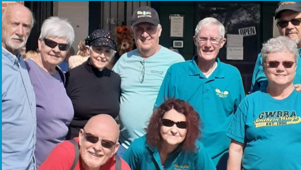
Chapter Ride— Whistle Top Cafe Juliette