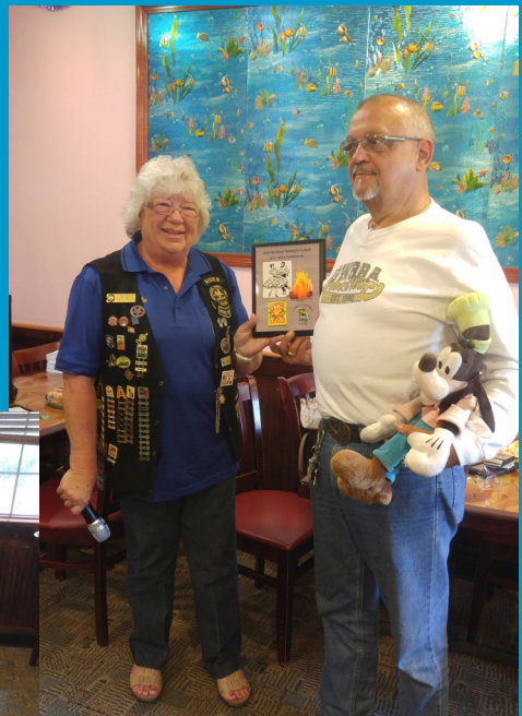
Plaque Attach - GA-A, McDonough