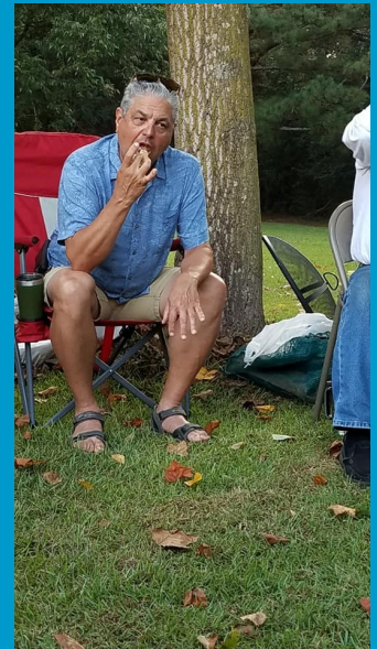
National S'mores Day Celebration!