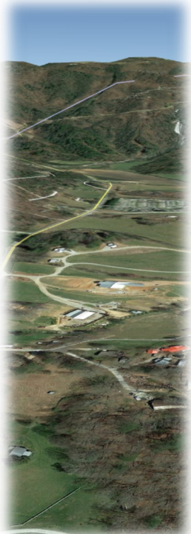
View towards River Vista, Dillard, GA