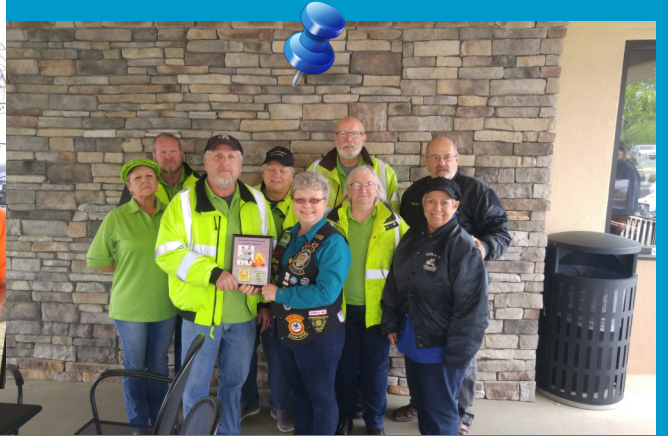
Georgia Traveler's Plaque give away