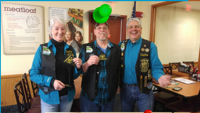
April Gathering & Awards!