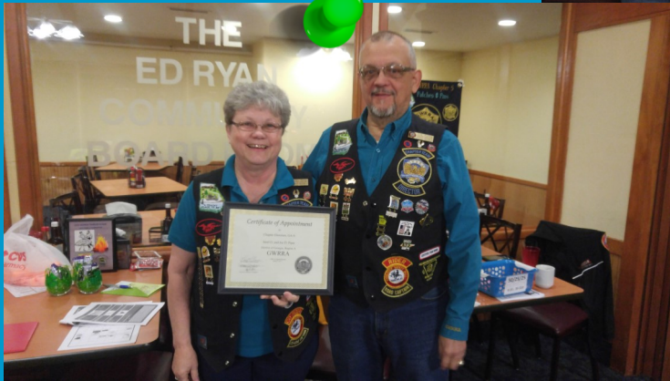
March Gathering - Awards!

Georgia Traveler's Plaque give away? We'll try again in April!