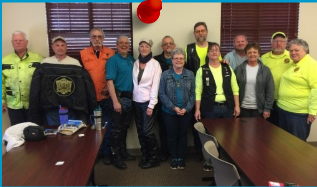
First Aid and CPR Training