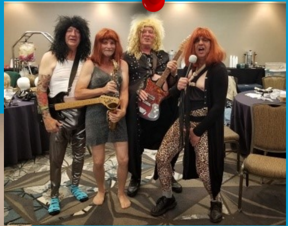
Florida District Rally