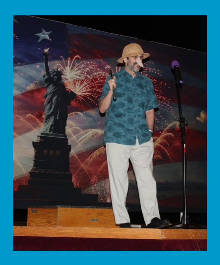
The Bob Hopeless Show took 2nd place in the talent show