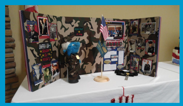
Mascot Contest (2nd Place!)