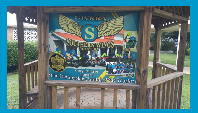
GA-S' New Chapter Banner