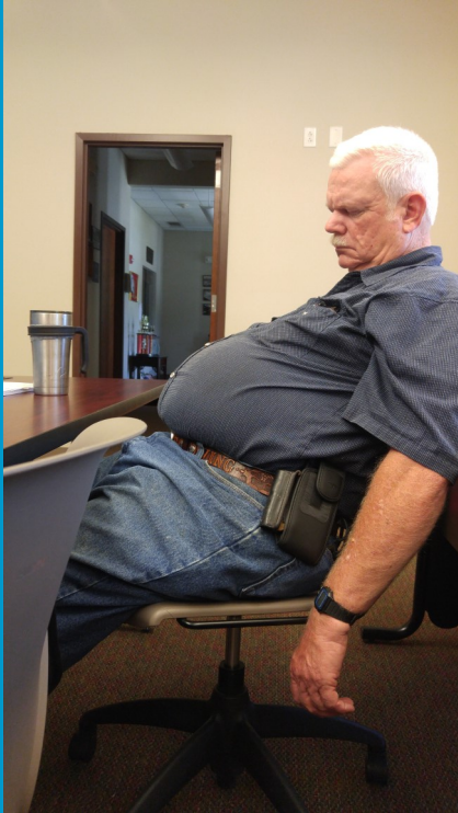
Stop the Bleed Training