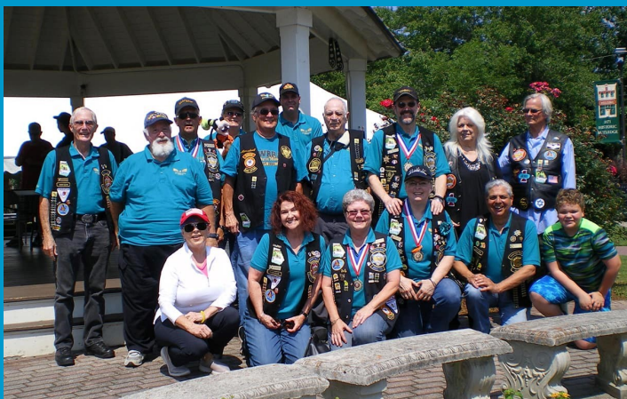
Lunch Ride to Yesterday's Café in Rutledge