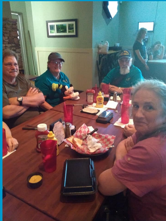
Meet-N-Eat at Top Dog Tavern in Bethlehem