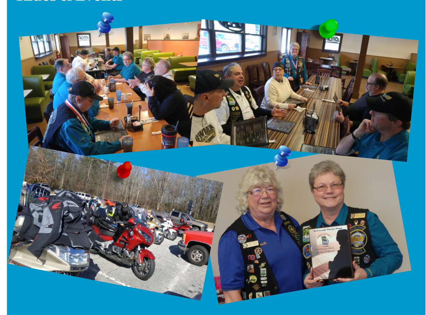
January Plaque Attack!