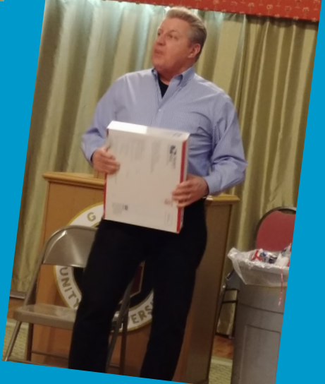
2018 Christmas Party