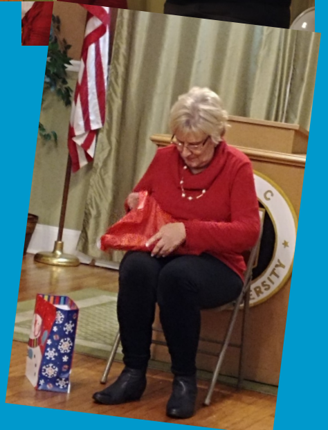
2018 Christmas Party