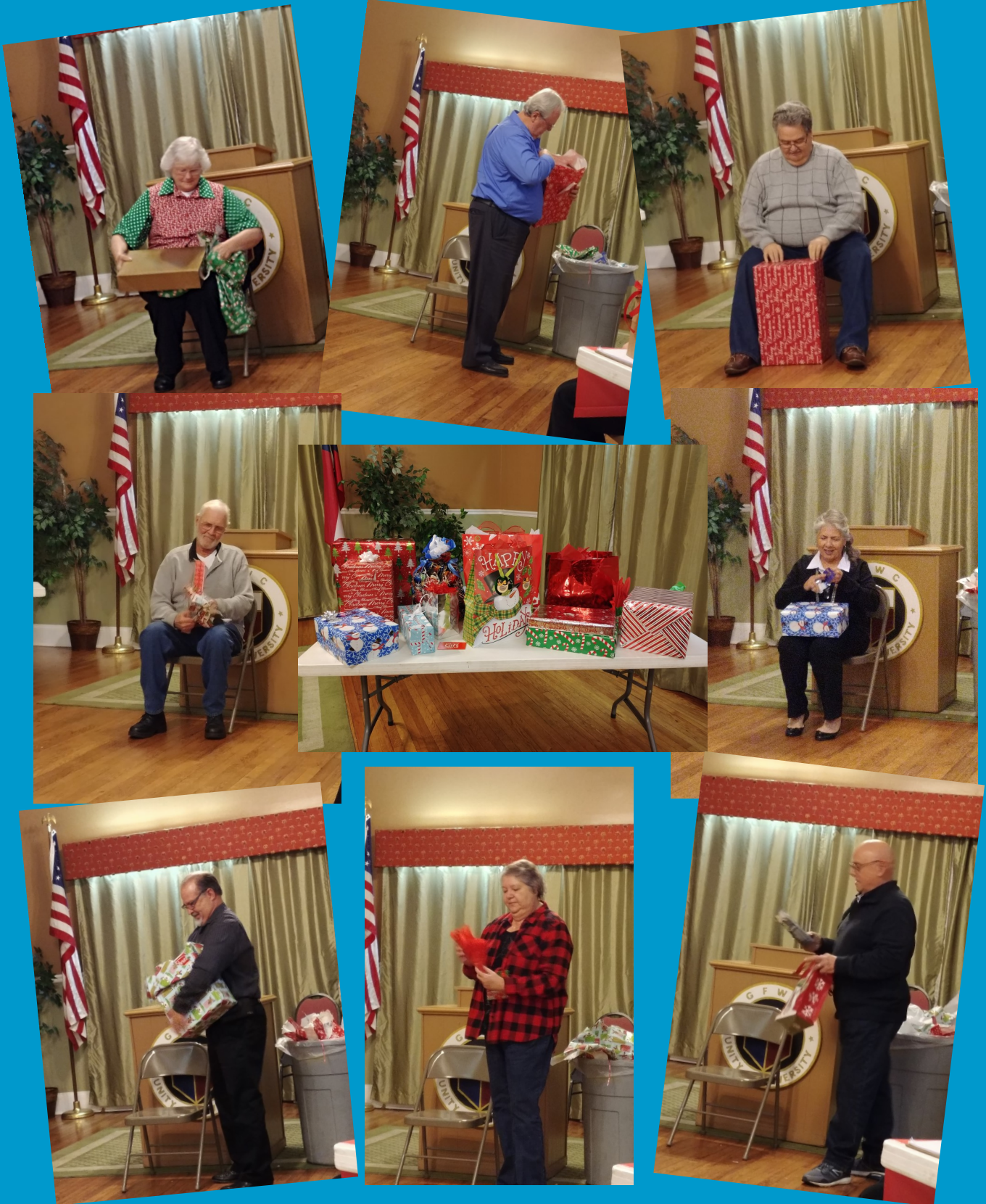
2018 Christmas Party