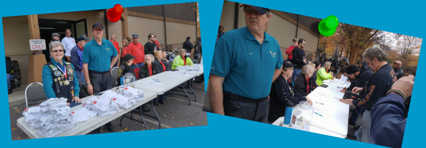
Salvation Army Toy Ride