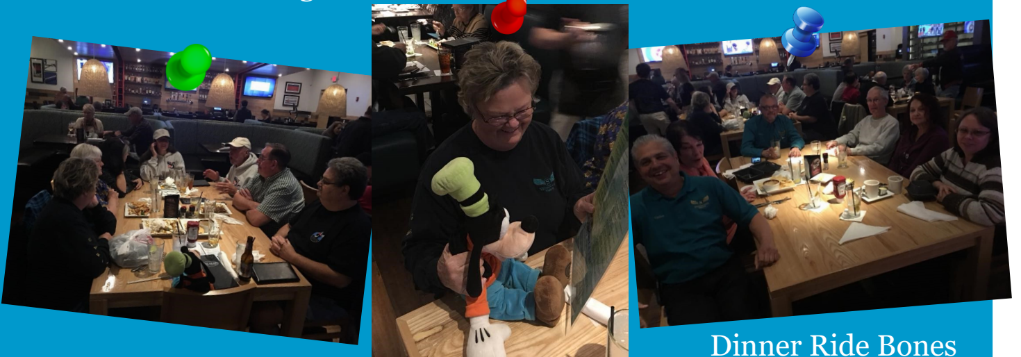
Dinner Ride Bones