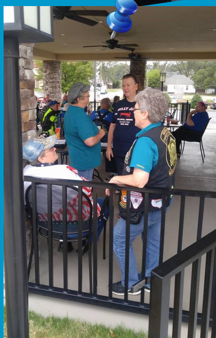
Traveler's Plaque Give-away