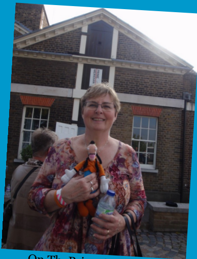
On ThePrime Meridian