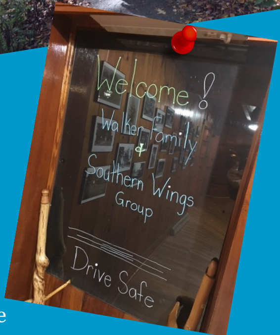
2017 Leaf Ride