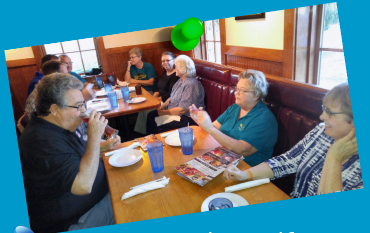
Dinner Ride Fatz