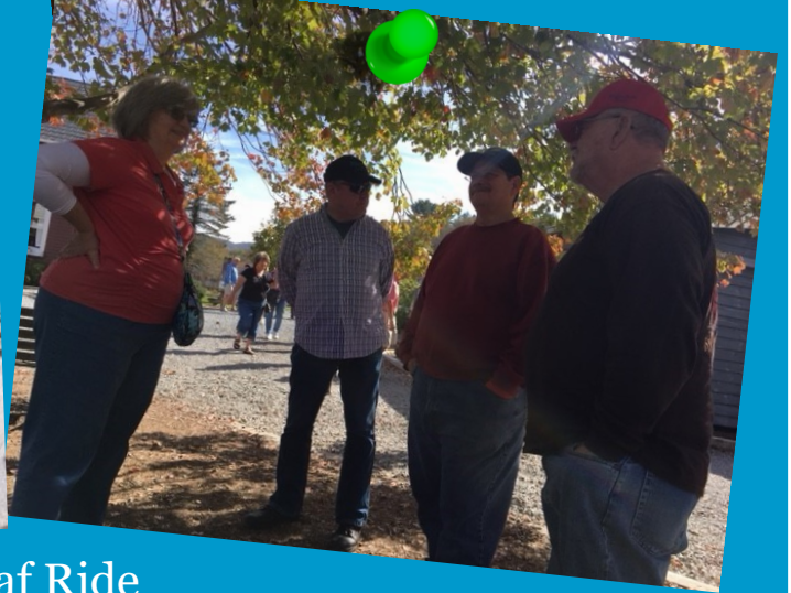
2017 Leaf Ride