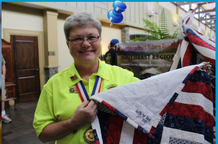
Region A Rally