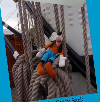
Aboard the Cutty Sark