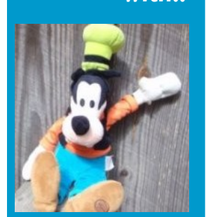
"I Love to Ride"