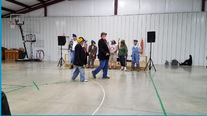
Chapter T Fun Day