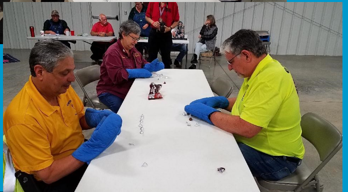
Blazer's Dinner Ride